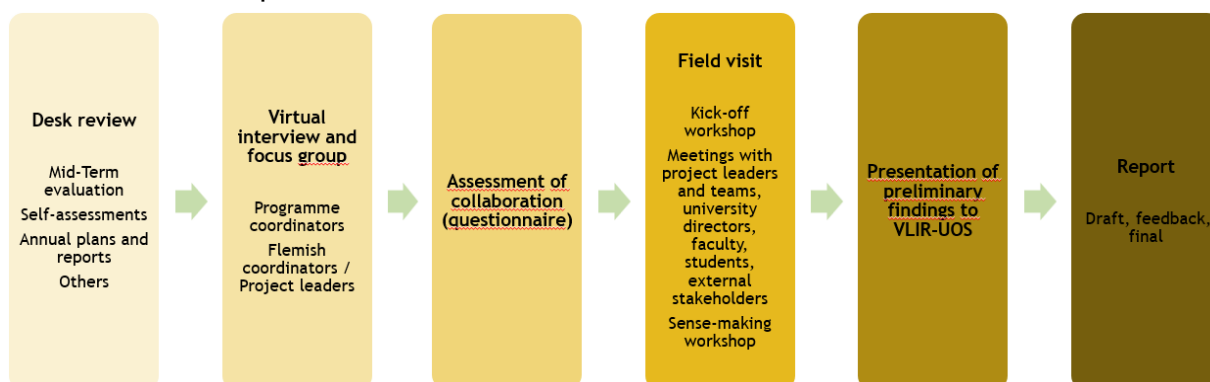
Figure 1. Evaluation process (IUC)